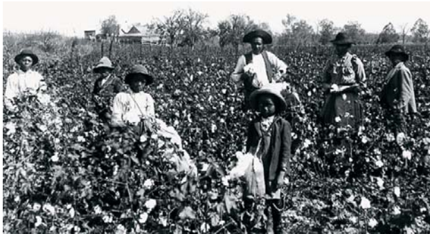
1619 The first slaves arrive in Virginia and are forced to work on fields